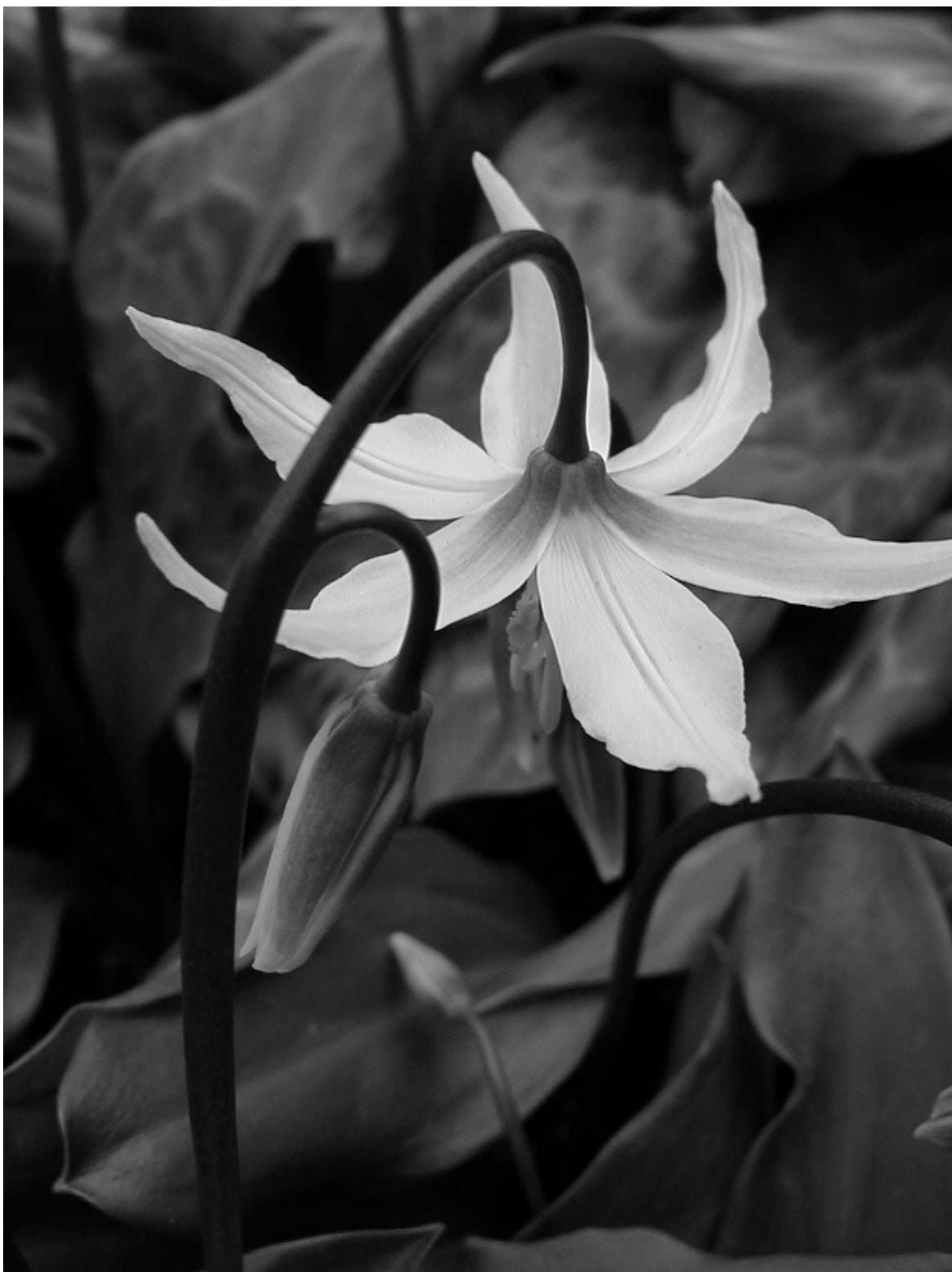
Erythronium elegans