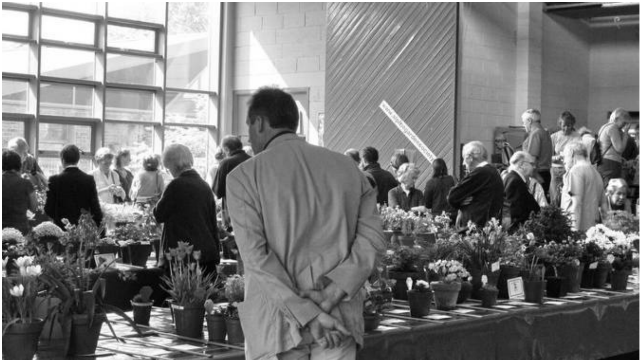
A section of the Dublin AGS Show 2007

Do your best to come, enter your plants, bring your friends and help us to make it our most successful Show yet.”