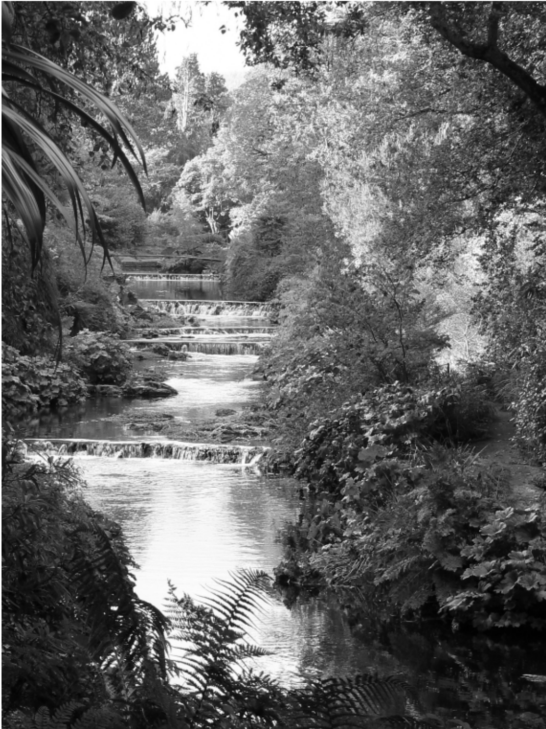
Mount Usher Gardens

magnificent splendour around the house itself. The garden holds two NCCPG National Collections, Eucryphia and Notofagus , of which we saw many specimens.