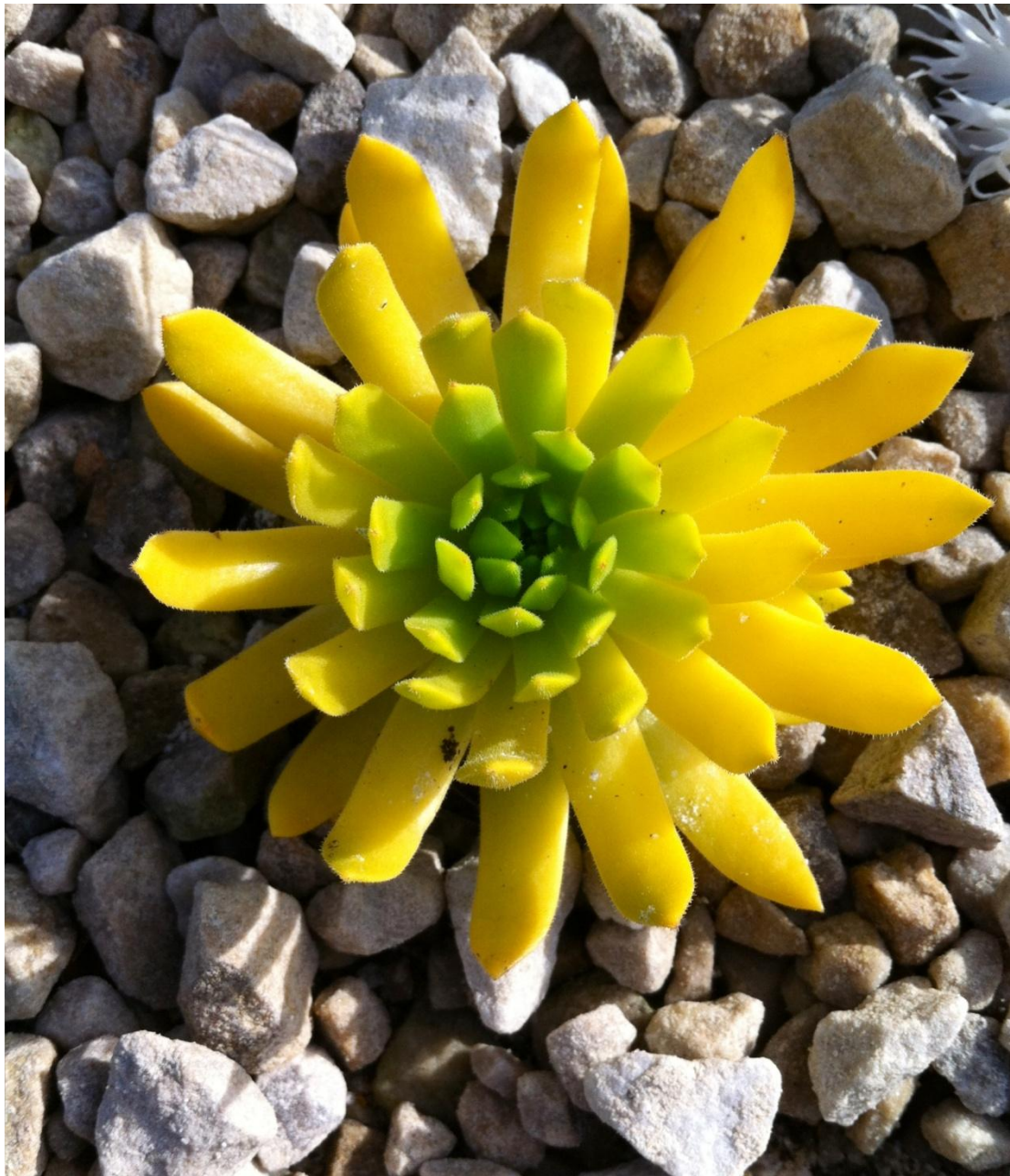
Sempervivum 'Cmral's Yellow' – See p. 5.

This newsletter is edited by Billy Moore who can be contacted at 32 Braemor Park, Churchtown, Dublin 14. Email: wjmoore@iol.ie .