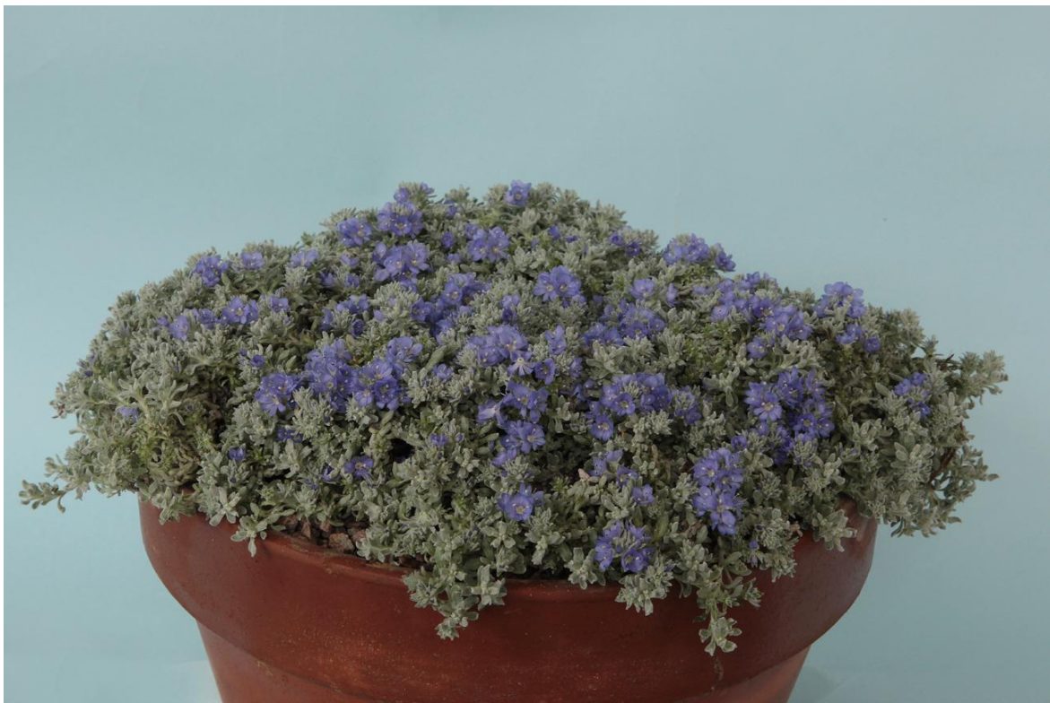
Veronica bombycina var. bol kardaghensis