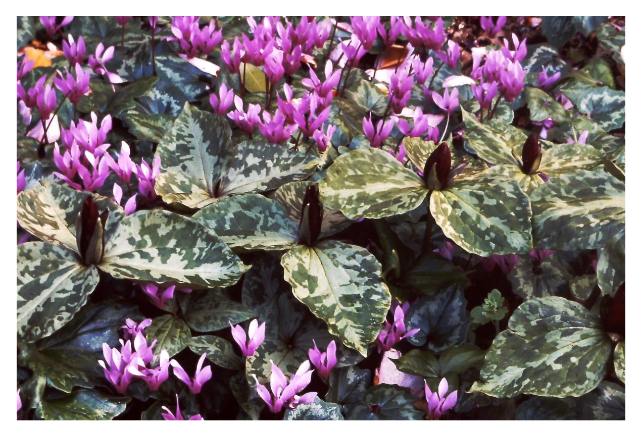
Trillium cuneatum with Cyclamen repandum - see p. 31.