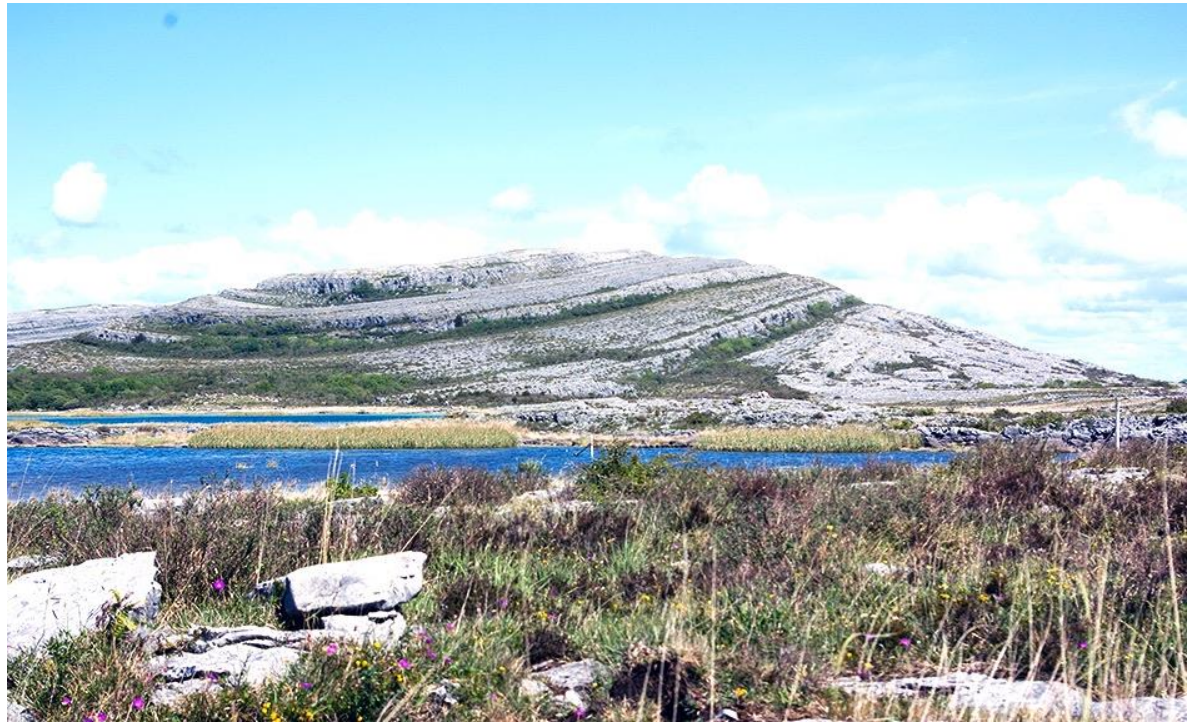
Mullach Mór.

in 'the Barony of Burren, County Clare'. The vernacular use of the word refers to a region of limestone, cropping out as pavement or partially covered by thin soils, which is more extensive than the Barony of Burren. Its northern boundary is Galway Bay west of Kinvara and the Atlantic as far west as Doolin Point but the Aran Islands are identical in geology and contain much of the same flora. Its poorly demarcated southeastern boundary encloses the villages of Kilfenora, Corofin and Tubber. In fact, limestone pavement, in places densely covered by hazel scrub and in some areas carrying elements of the typical Burren flora, is more extensive still and can be traced into parts of east County Clare and south County Galway. The landforms of all of this area are described as glacio-karstic.