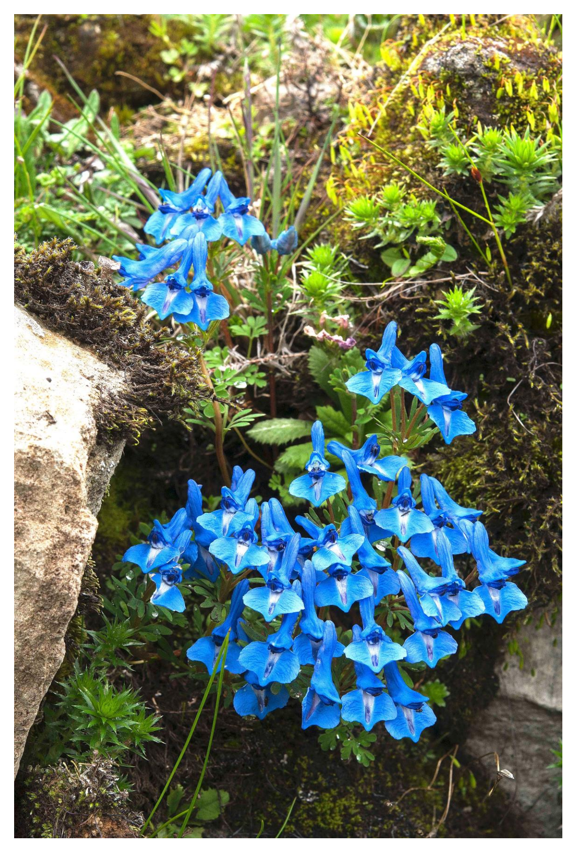
Corydalis ecristata See p. 34.