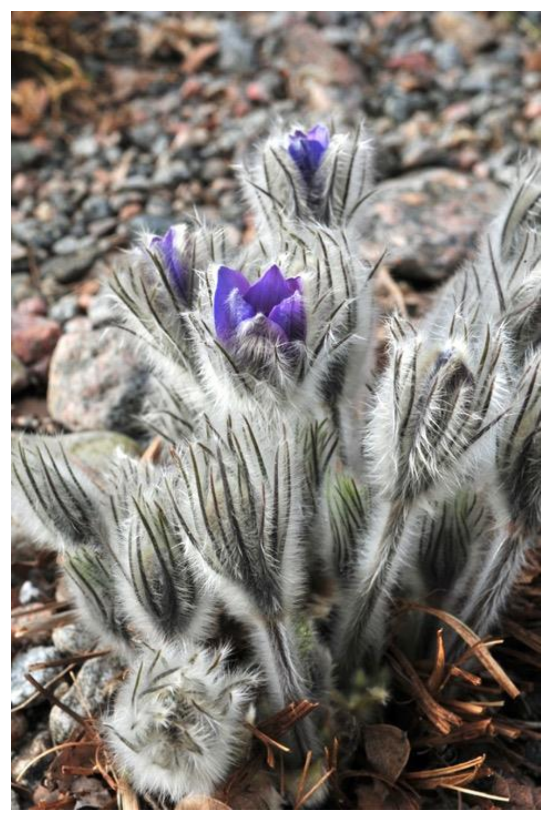
Pulsatilla halleri - see p.16.